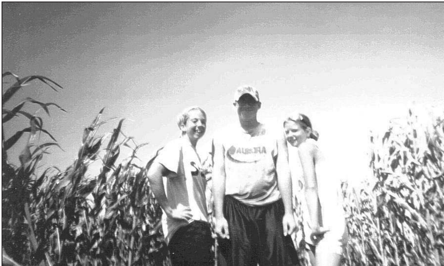
Craig Ediger / The Tattoo

Our bosses don't just throw us into the fields